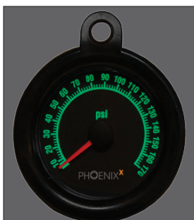
Backlit dial/needle is easy to read in low light conditions

To Order 800-998-9897 myerstiresupply.com