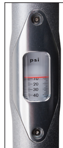
Readings in 2.5 psi. increments